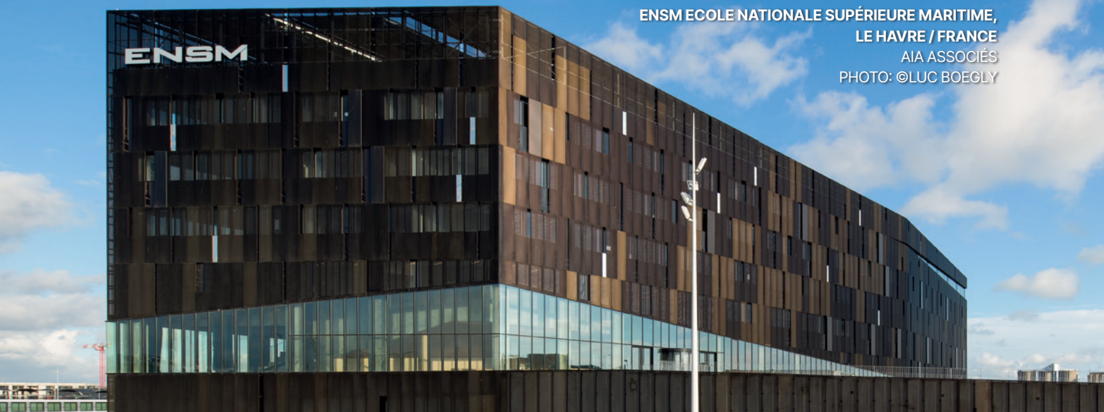
ENSM ECOLE NATIONALE SUPÉRIEURE MARITIME, LE HAVRE / FRANCE AIA ASSOCIÉS